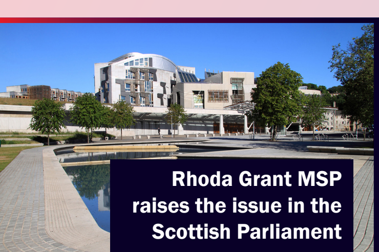
Rhoda Grant MSP raises the issue in the Scottish Parliament

200 postcards are delivered to the town hall for all 22 councillors. On the same day around 800 signatures are delivered to the Scottish Funding Council from the EIS FELA Executive opposing the privatisation of further education in Scotland