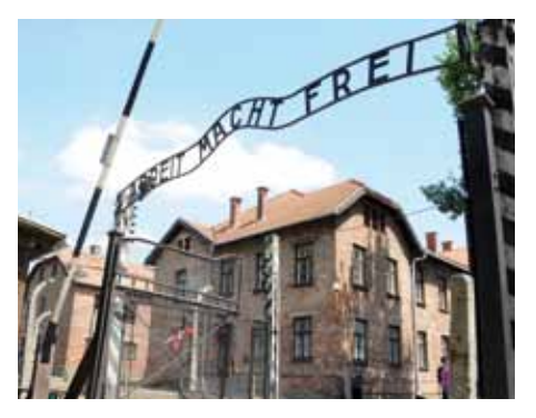
Auschwitz I was the first camp to open in 1940, and was primarily a concentration camp. It is walking into this camp that you

After this somber experience, our group walks back to the buses in near silence and we make the short drive to the first of the two Auschwitz camps that we will visit today.